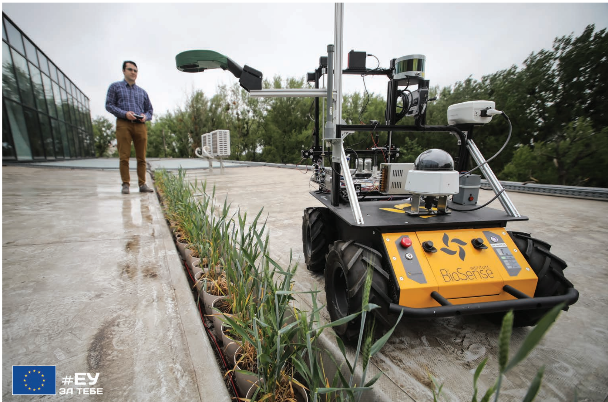
Remote controlled digital farming: a robotic system is able to analyse soil quality and the condition of plants. Farmers can thus better react and improve their agricultural production. A joint effort worth 28 Million euros between the European Union and Serbia, is turning the Novi Sad BioSense Institute into the European Centre of Excellence for advanced technology in sustainable agriculture.