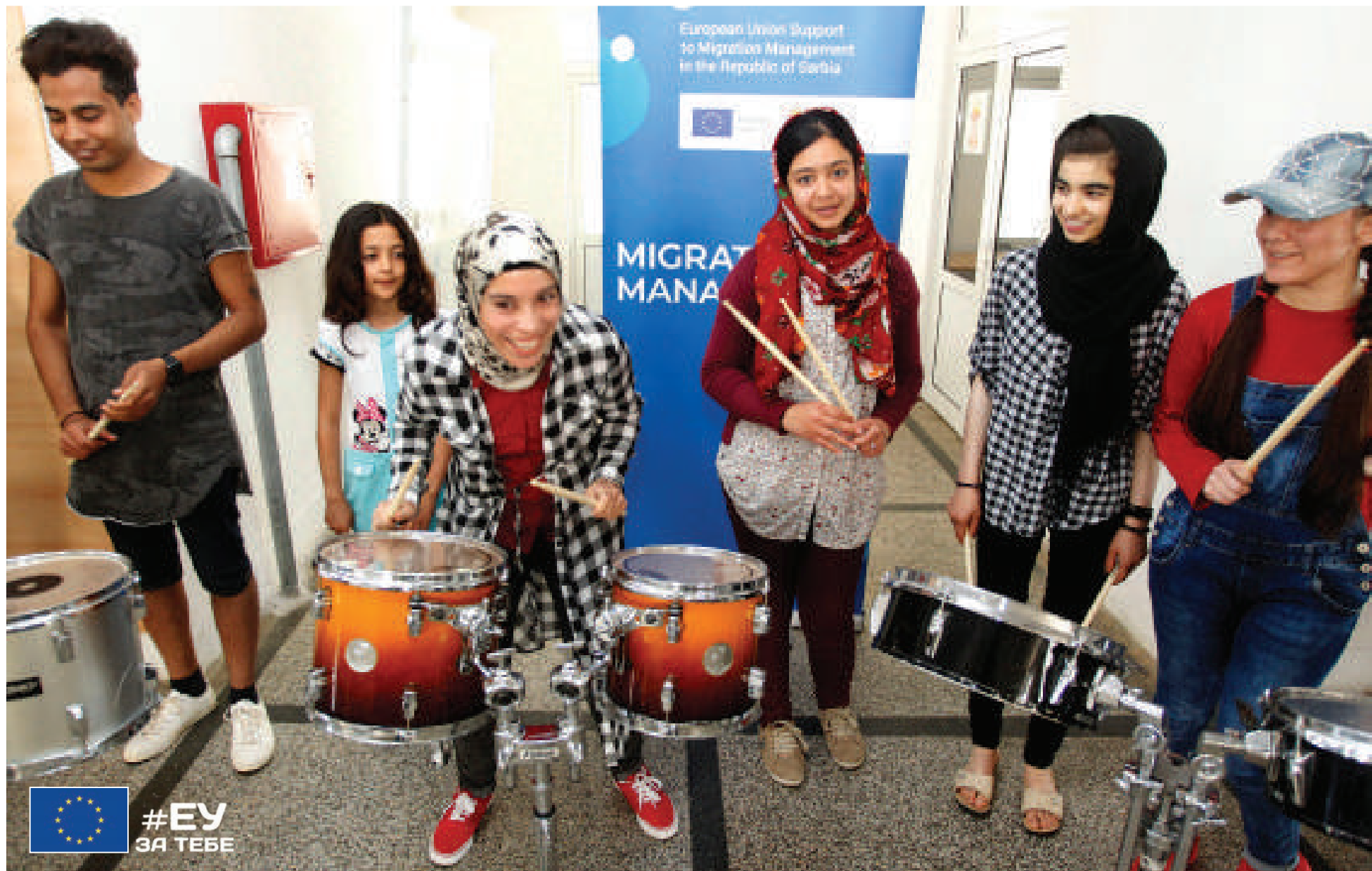
The children at the migrant reception centre develop new skills and have a creative pastime through educational activities. With the EU, managing migration means protecting our societies and in the same time ensuring that those who need have their rights respected and are able to live in dignity.