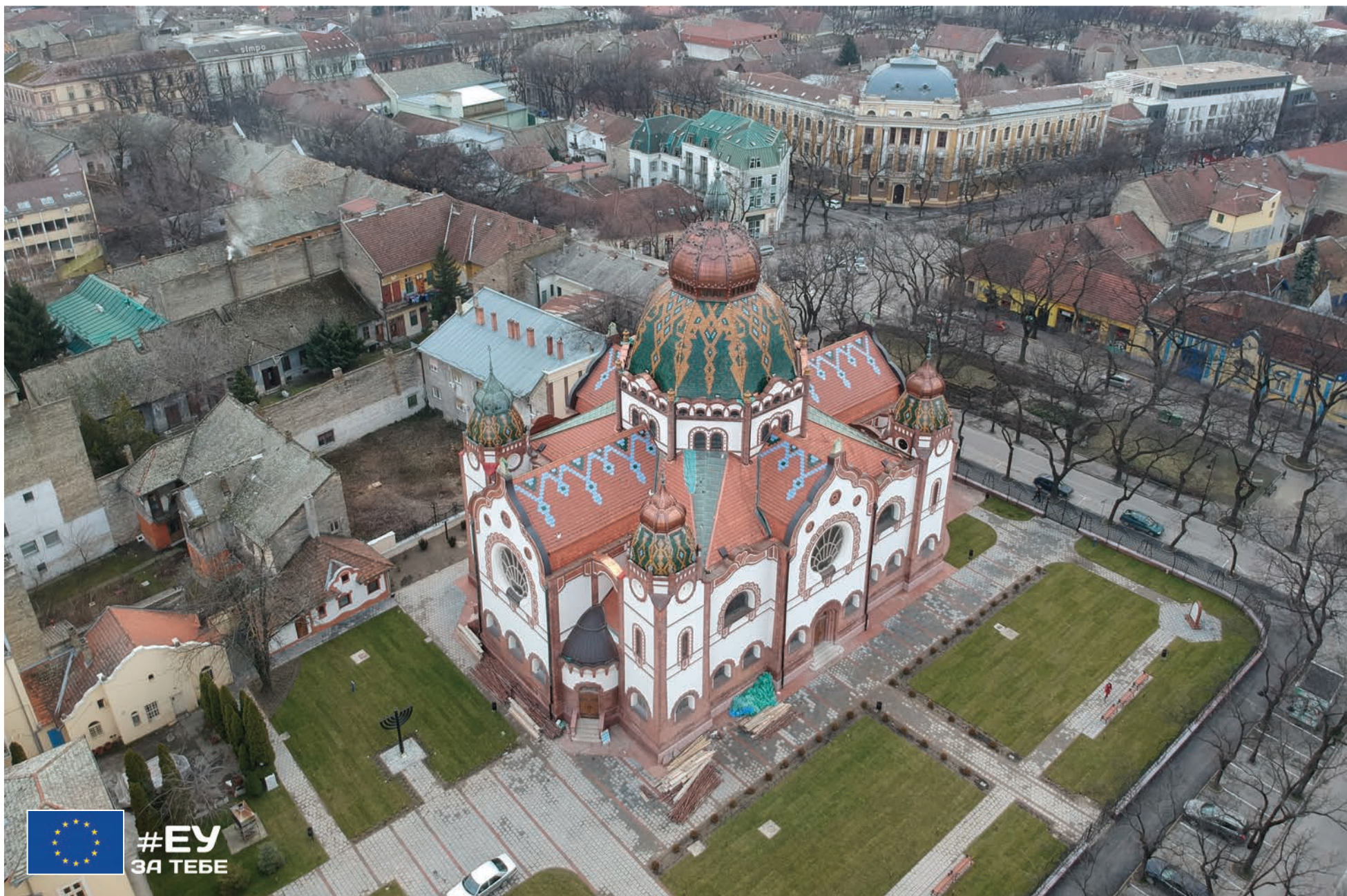
The synagogue in Subotica was restaured with combined efforts from the European Union, governments of Serbia and Hungary and the town of Subotica after four decades of neglecting. The European funds were also used in the restauration of the Golubac Fortress and Franciscan Monastery in Bac.