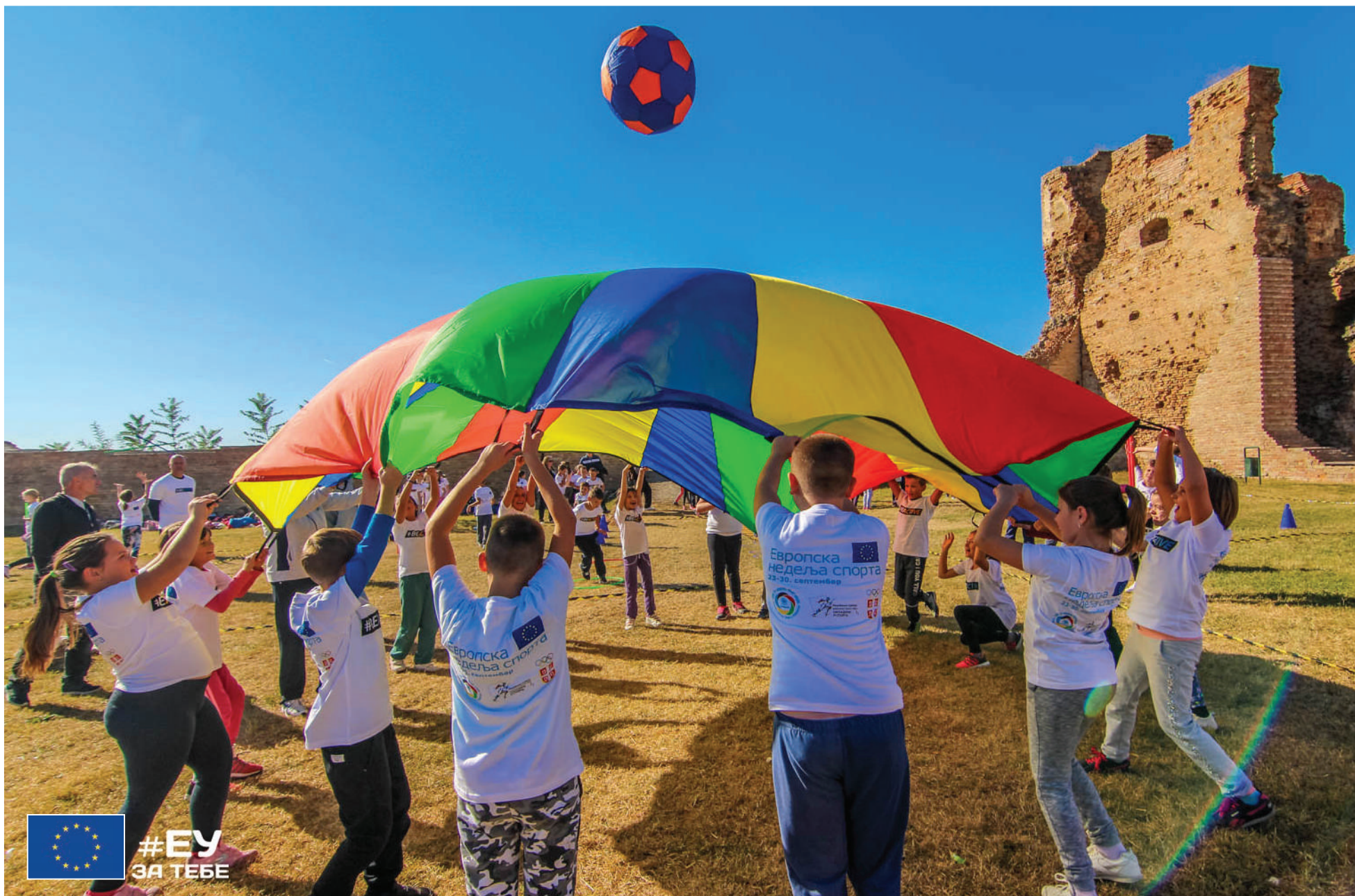
The Bac Fortress hosted the European Week of Sports under the auspices of the EU Delegation to Serbia. Through its youth programmes, the EU allows young people to develop new skills that will improve their performance in the job market later in life.