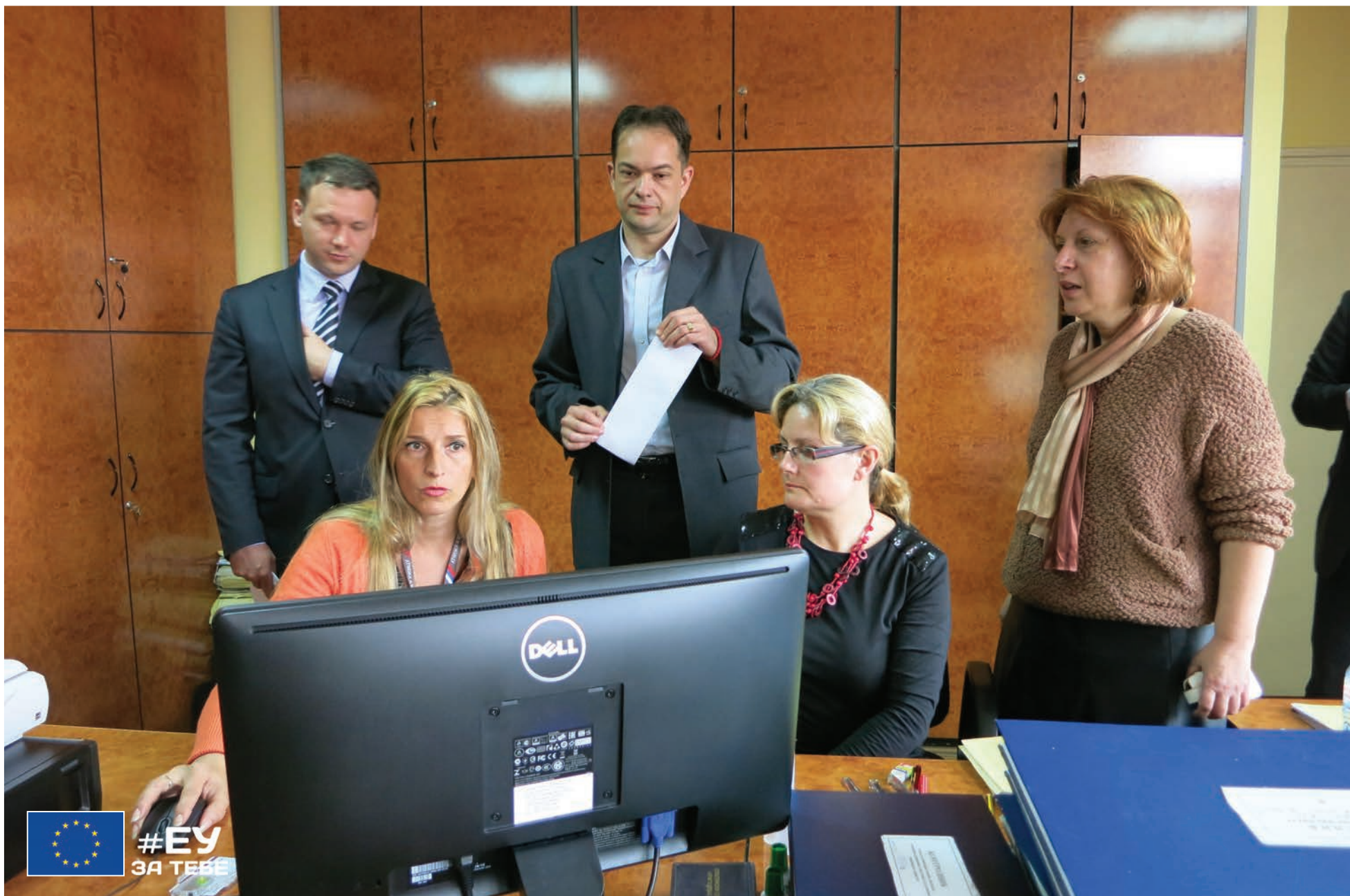
The clerk's office of the Court of General Jurisdiction in Uzice has been digitized thanks to the EU project "Improving Judicial Efficiency." All in all, the project led to solving a backlog of over 700.000 legal cases which were pending on Serbian citizens and entities.