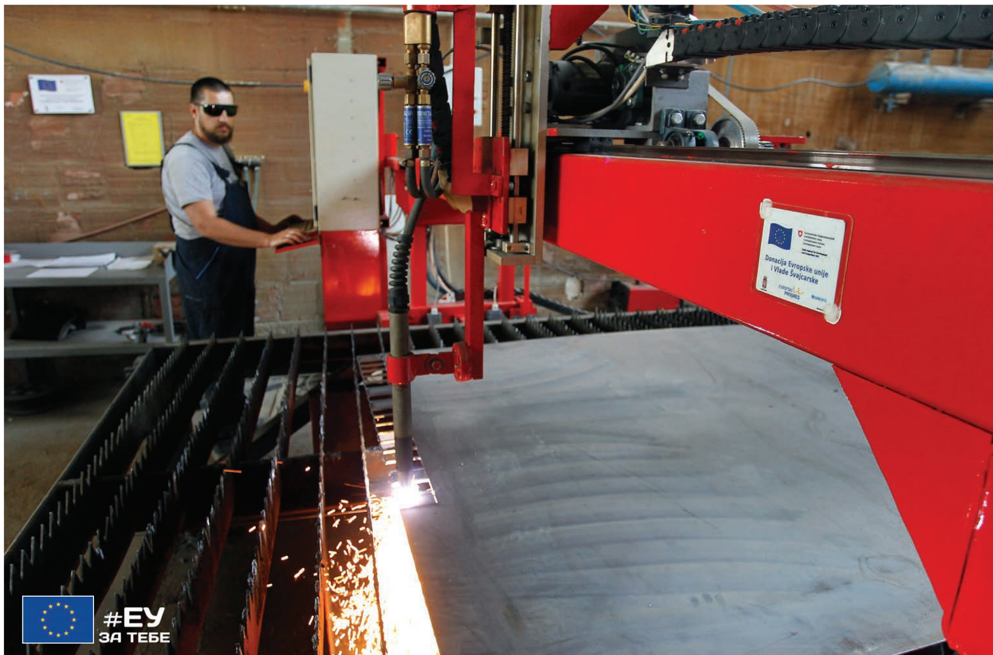
Kran Komerc Company from Knjazevac has purchased a new machine thanks to EU funding. Through different EU funds and programmes, numerous small-sized enterprises were offered a chance and money to develop their business.