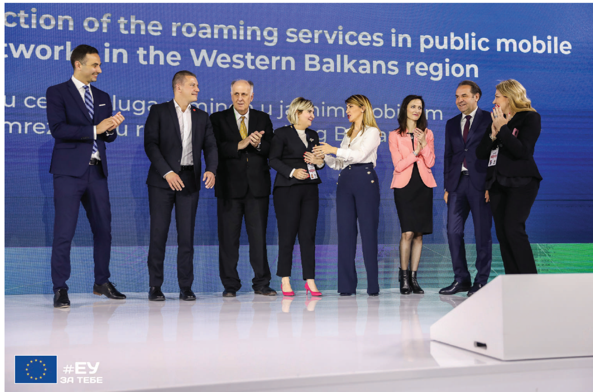
During the Western Balkans Digital Summit, held in April 2019 in Belgrade, a regional agreement was signed aimed at reducing roaming charges and bringing citizens in the region closer together.