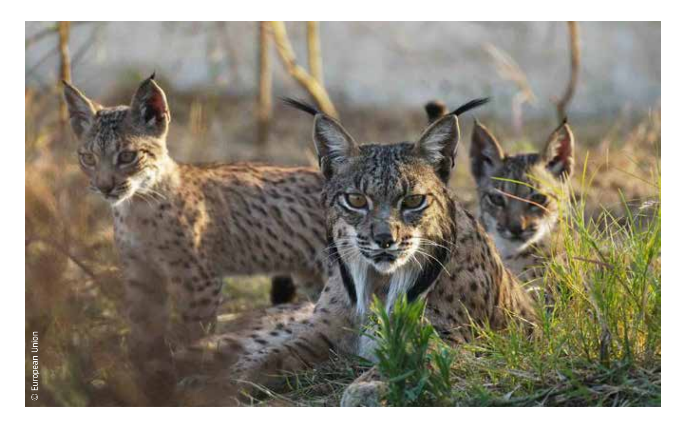
The Natura 2000 network covers almost 18 % of EU territory and protects species and habitats in their natural environment.

The need to make efficient use of finite resources is a theme being integrated into all EU policies. To encourage individuals to change their behaviour, the European Commission launched a public information campaign in autumn 2011. To drive the process forward, it created a high level panel of policymakers, industrialists and experts with extensive economic and environmental expertise, who delivered a set of recommendations in the spring of 2014.