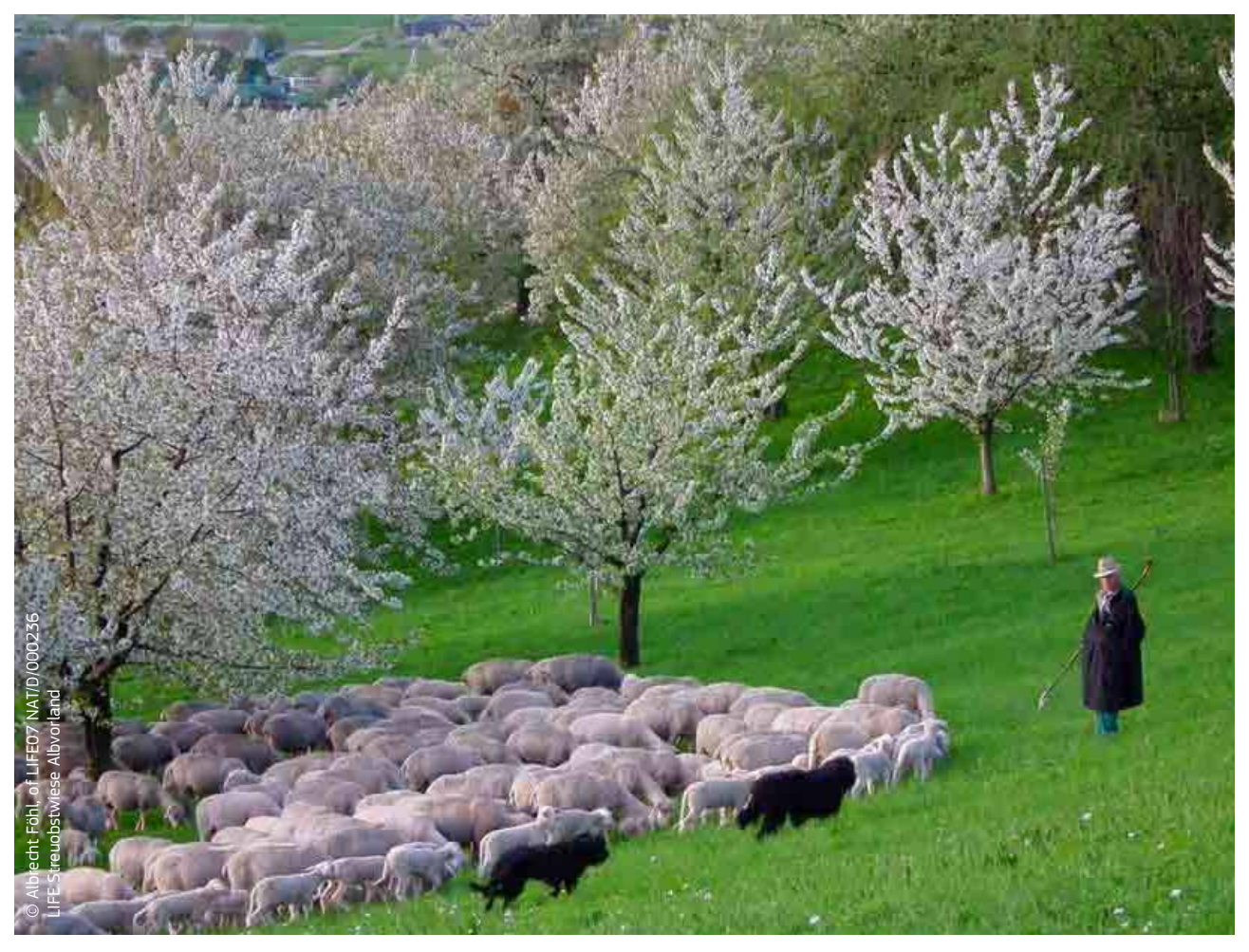
Healthy ecosystems are key to Europe's biodiversity.